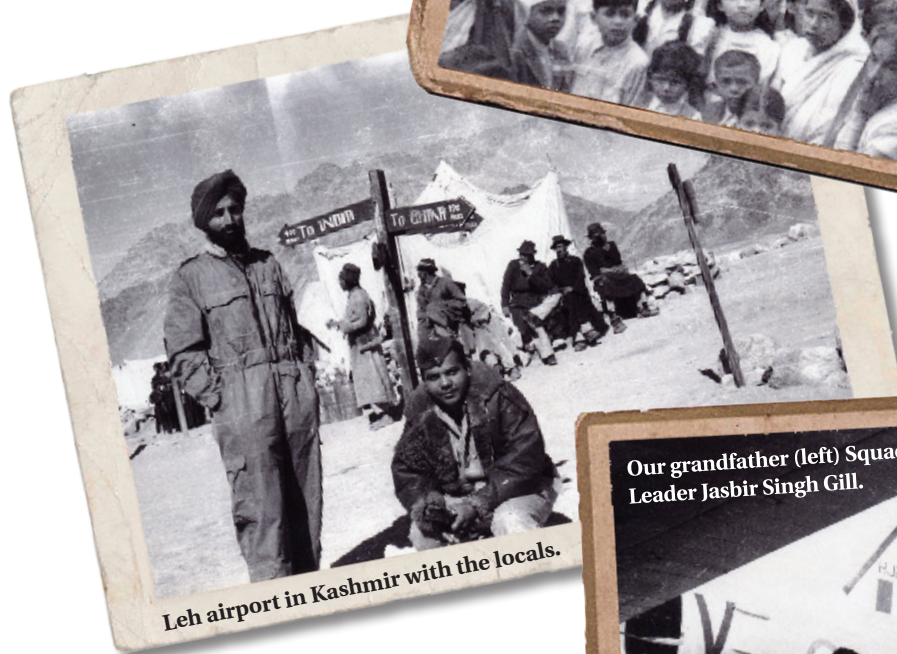
Leh airport in Kashmir with the locals.