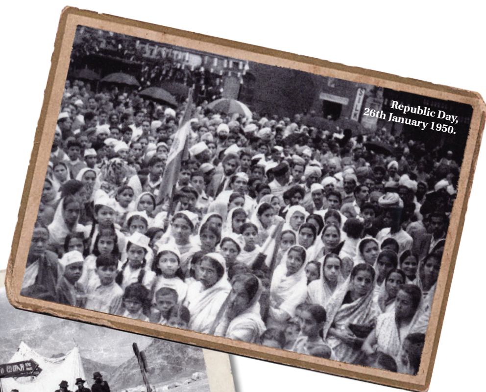
Republic Day, 26th January 1950.