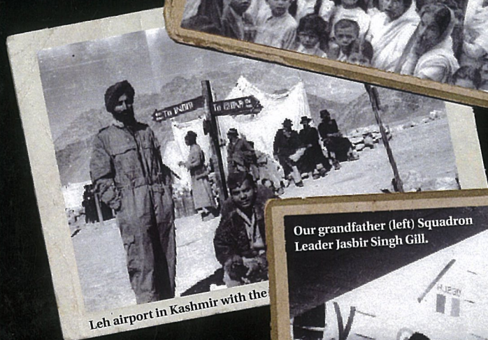
Leh airport in Kashmir with the