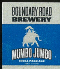
Mumbo Jumbo - $7.50 India Pale Ale