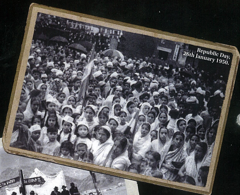
Republic Day, 26th January 1950.