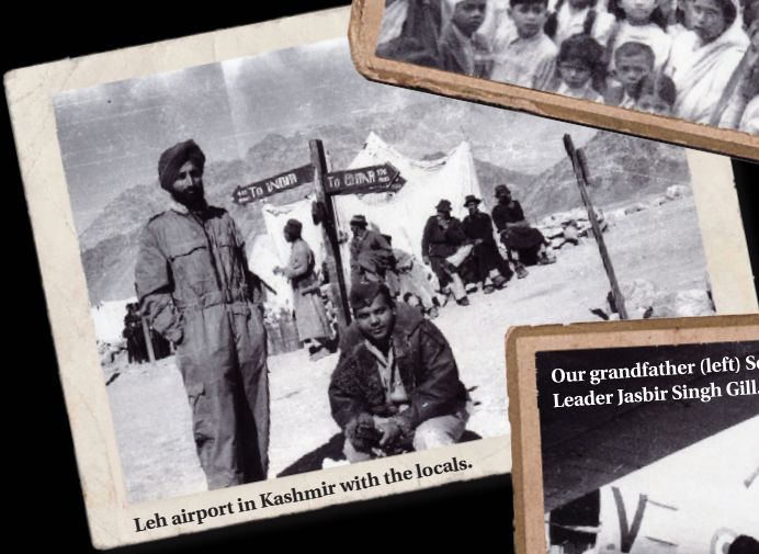
Leh airport in Kashmir with the locals.