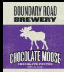
Chocolate Moose - $7.50 Chocolate Porter