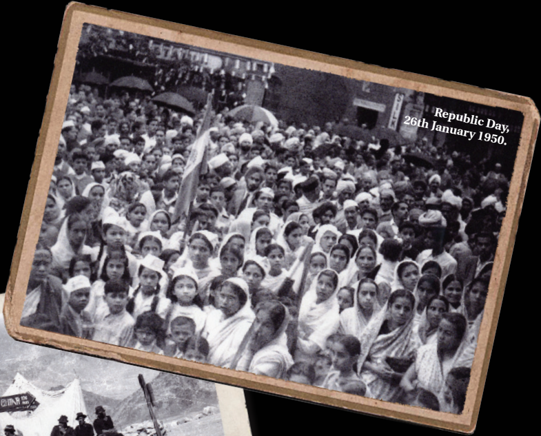
Republic Day, 26th January 1950.