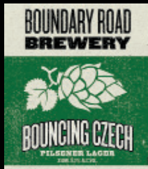
Bouncing Czech - $7.50 Pilsner Lager