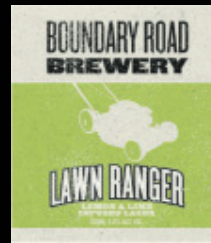
Lawn Ranger - $7.50 Lemon & Lime Infused Lager