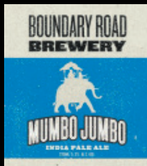
Mumbo Jumbo - $7.50 India Pale Ale