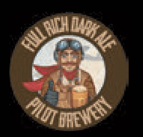
Full Rich - $12.00 Dark Ale (500ml)