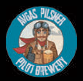
Avgas Bohemian - $12.00 Pilsner