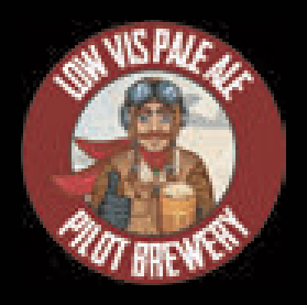
Low Vis - $12.00 Indian Pale Ale (500ml)