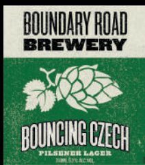
Bouncing Czech - $7.50 Pilsner Lager