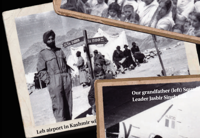
Leh airport in Kashmir with