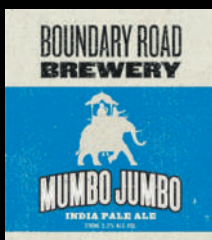
Mumbo Jumbo - $7.50 India Pale Ale