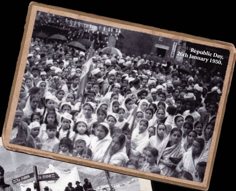
Republic Day, 26th January 1950.