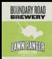
Lawn Ranger - $7.50 Lemon & Lime Infused Lager